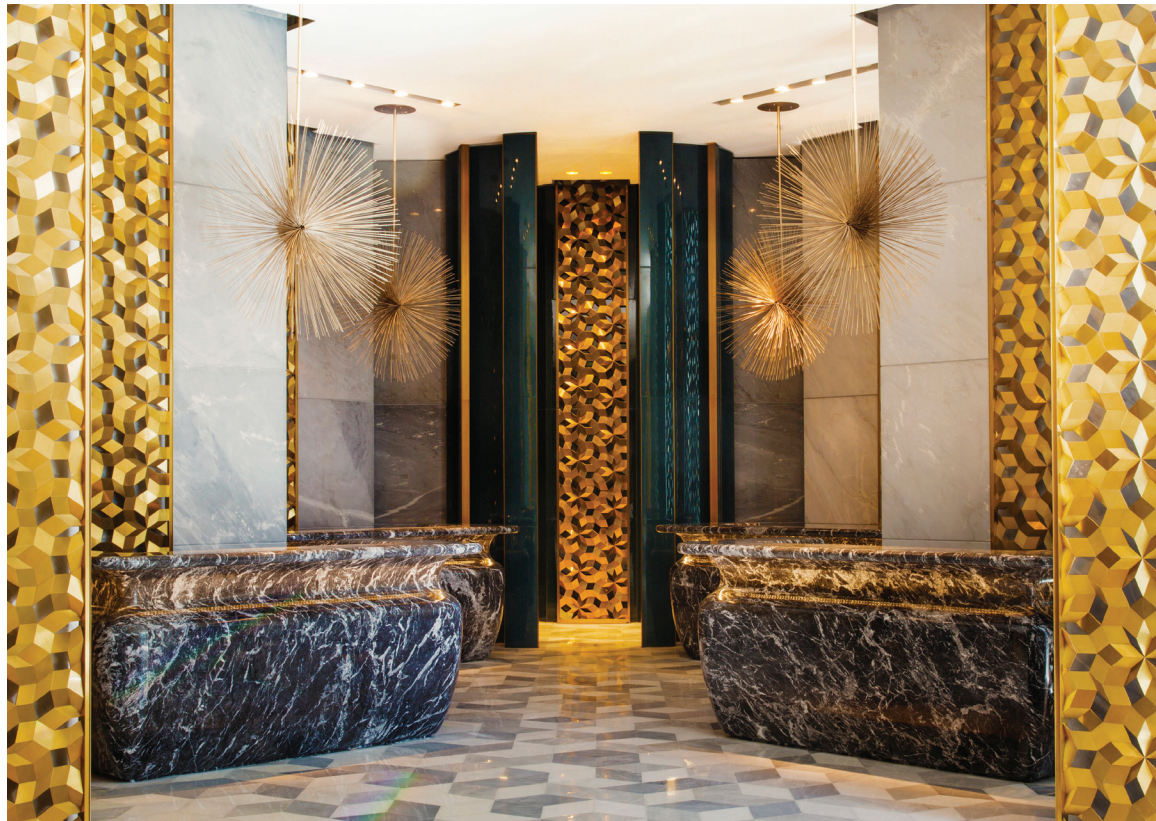
▲ DANDELION CHANDELIERS IN HAIRLINE BRONZE ▲ H55"/1400mm x W17.7"/450mm.