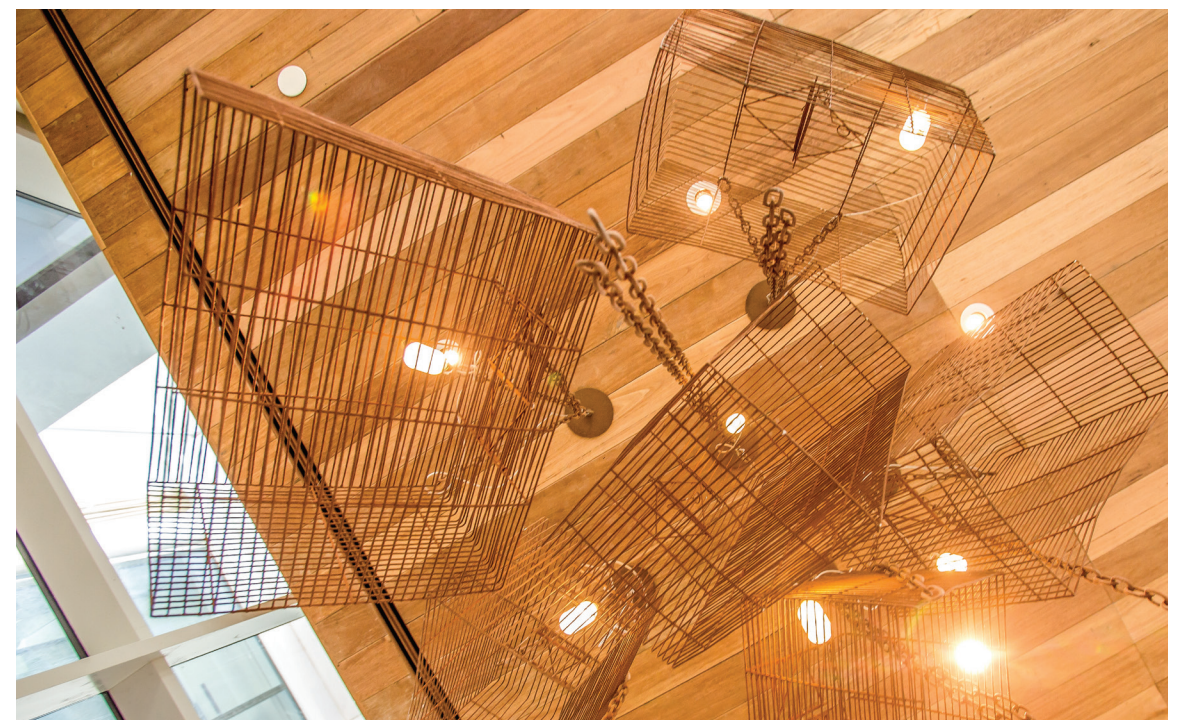
CUSTOM WIRE GEOMETRIC PENDANT CLUSTERS Mesh pendant boxes range from L15.7"/400mm x H10.2"/260mm x W9.1"/230mm to L25.2"/640mm x H19.7"/500mm x W13.8"/350mm. The rustic iron wire box was then deformed to create a warped shape. Hung by metal chains from a metal canopy mounted on the ceiling.