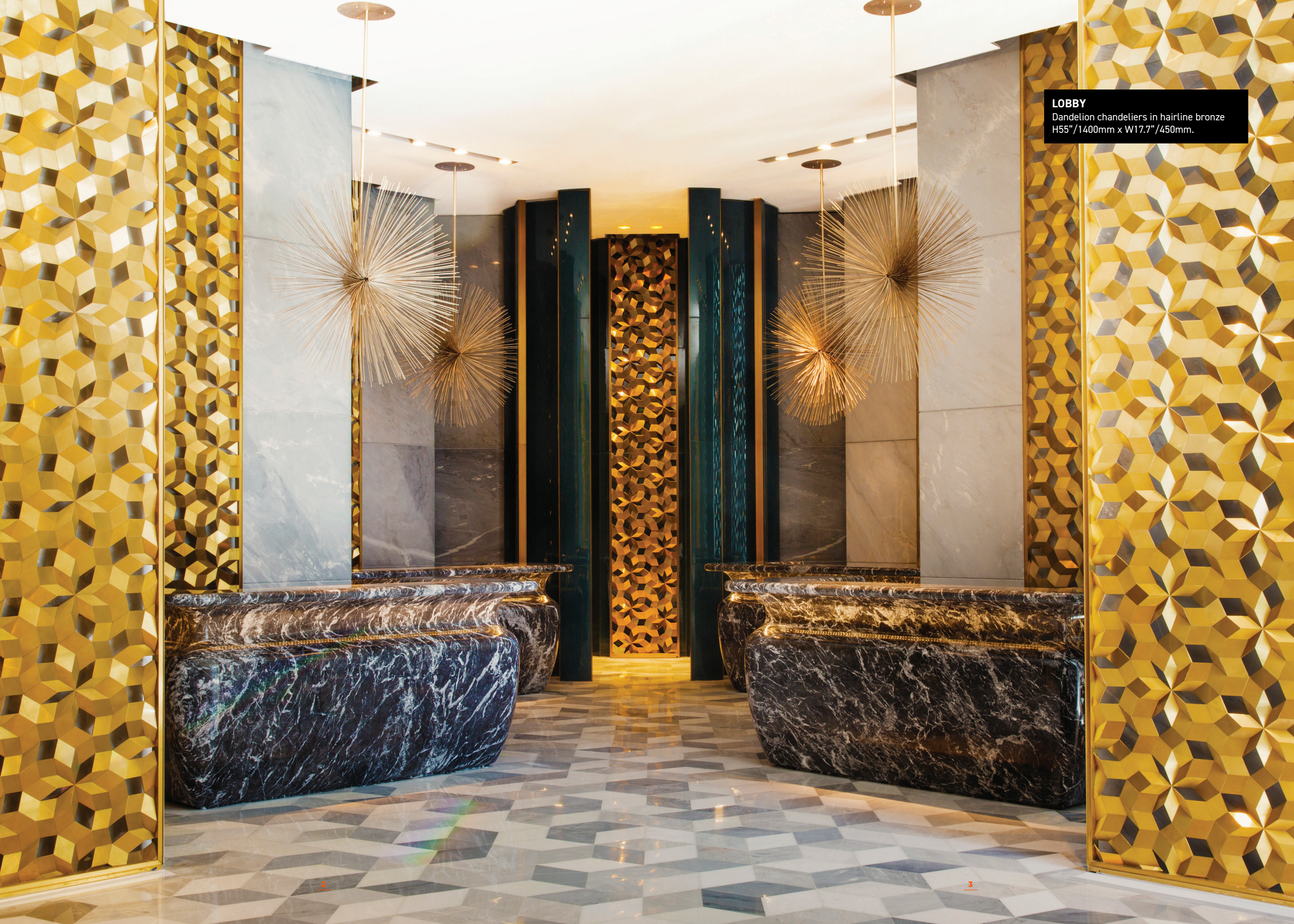
LOBBY Dandelion chandeliers in hairline bronze H55"/1400mm x W17.7"/450mm.