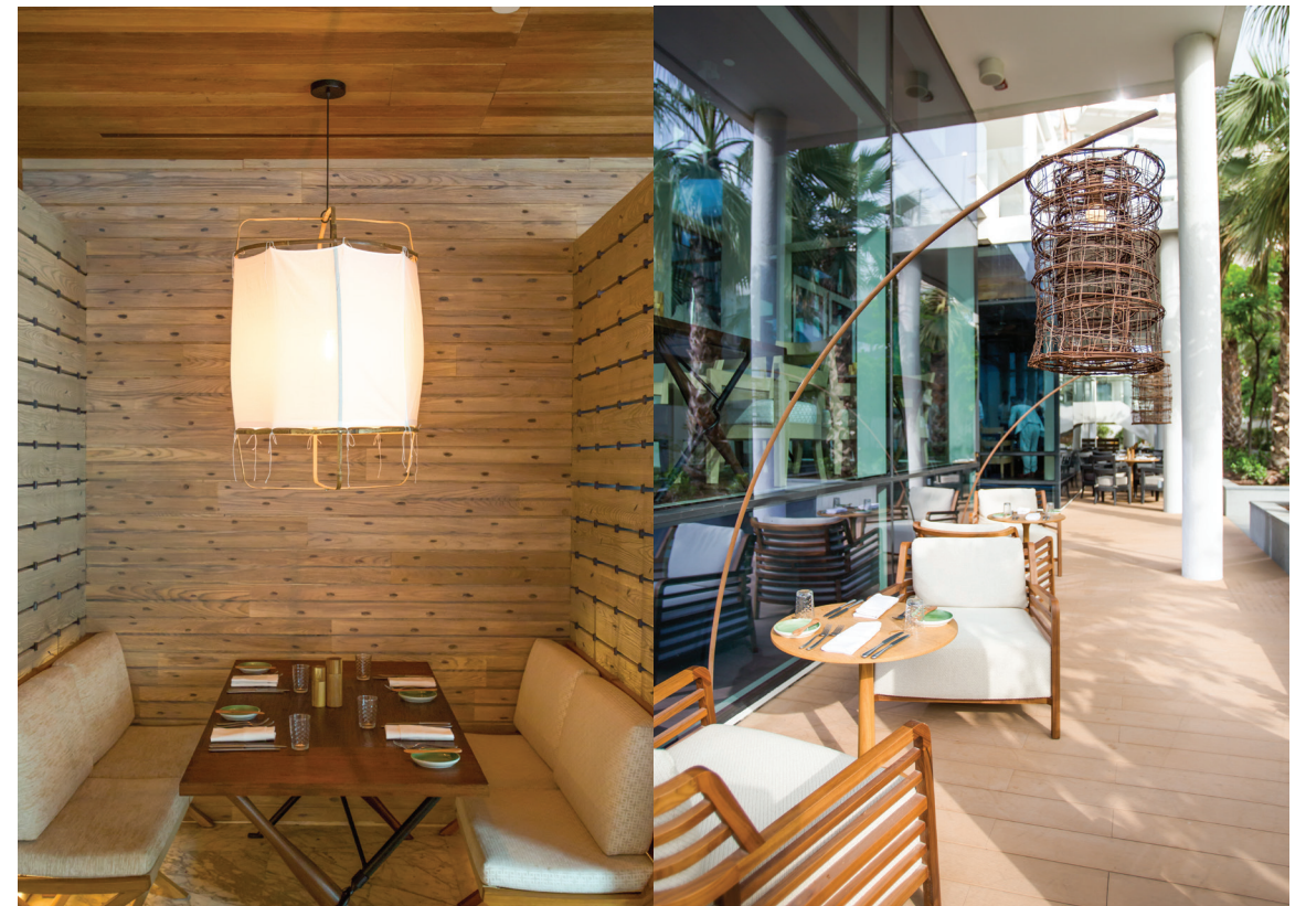
CYLINDRICAL RESTAURANT PENDANT D19"/485mm x H28.5"/725mm with max 118"/3000mm drop. Made from bamboo frame covered in woven fabric.