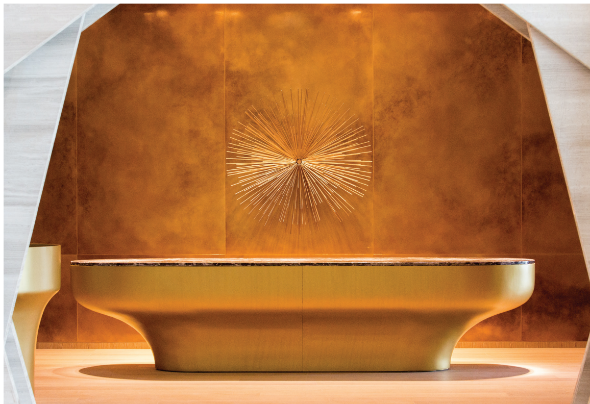
≡ DANDELION WALL FIXTURE ≡ H55"/1400mm by W8.85"/225mm with hairline bronze finish. ≡ Mounted on wall.