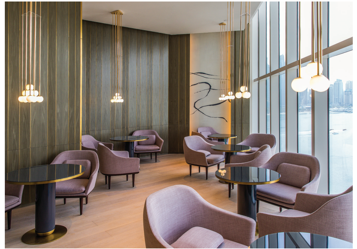
▲ CUSTOM PENDANT CLUSTERS ▲ Frosted glass globes in clusters of 3 and 6. Metal suspension rods in brass finish. Globes measure 3.1"/80mm in diameter and both clusters feature a 78.7"/2000mm drop.