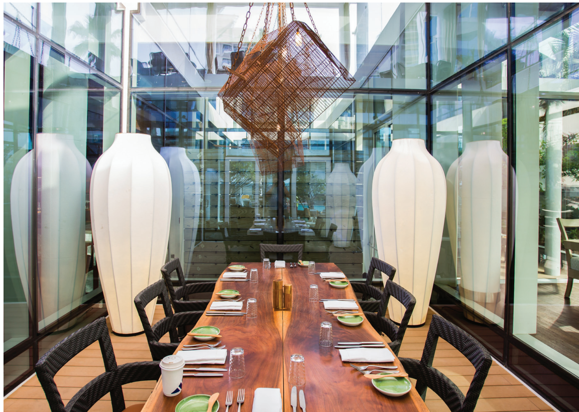
RESTAURANT FLOOR LAMPS D15"/380mm x H78.7"/2000mm. White shade made from resin. Acrylic diffuser with custom pattern on top.